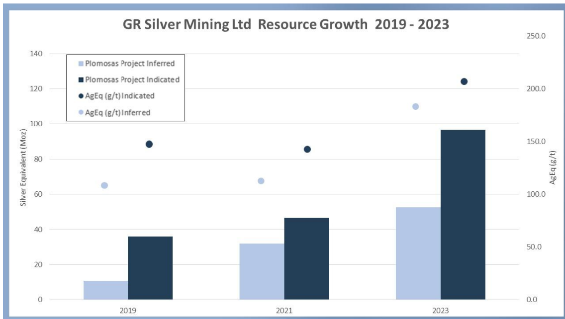
Figure 1 Resource Growth