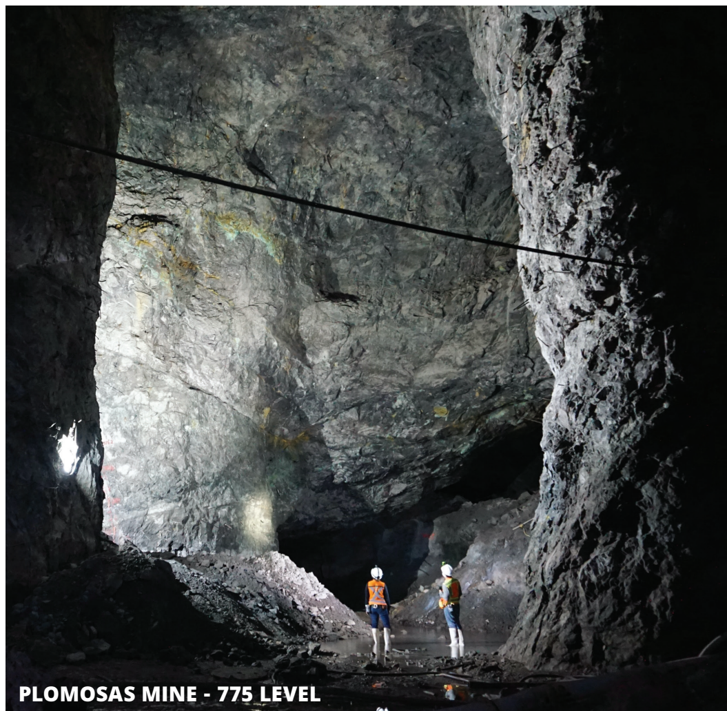
PLOMOSAS MINE - 775 LEVEL